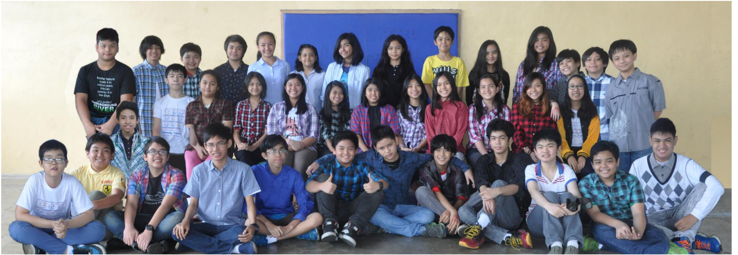
Grade Six Class Picture